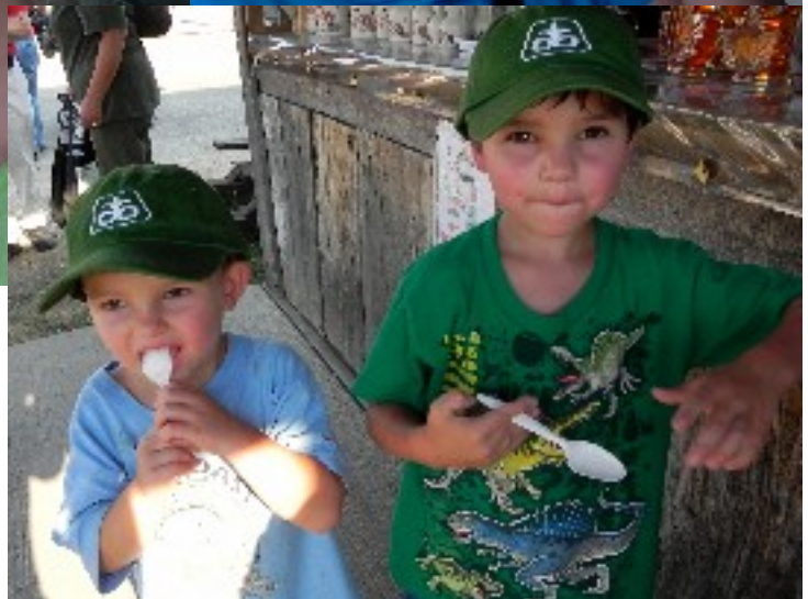
Some could just not get enough of that spoon after it had maple syrup on it.