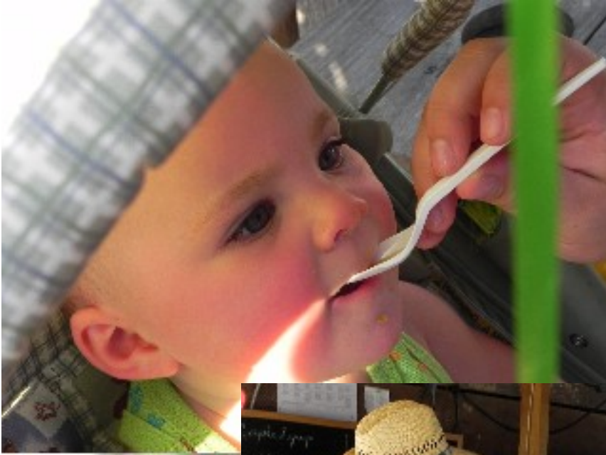
All ages loved tasting the wonderful syrup.