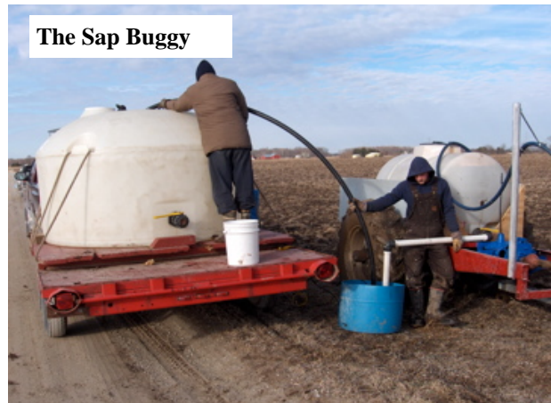
The Sap Buggy

2010 was one of the shortest (if not THE shortest) sea-